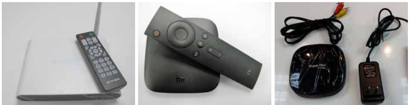
Examples of set-top boxes currently available in Hong Kong.

The Hong Kong Government recently introduced the 2014 Copyright Amendment Bill to the Legislative Council and IPR stakeholders are watching the Bill's progress with great interest. Effective IPR protection is a cornerstone for any community seeking to position itself as a hub for creativity, innovation, and IT services.