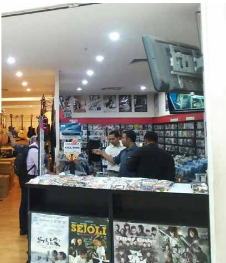
Pirated DVDs on display in Malaysia.