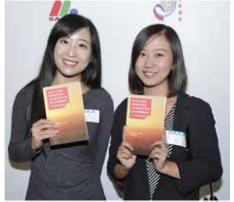
Students from the University of Southern California at the screening of The Nightingale