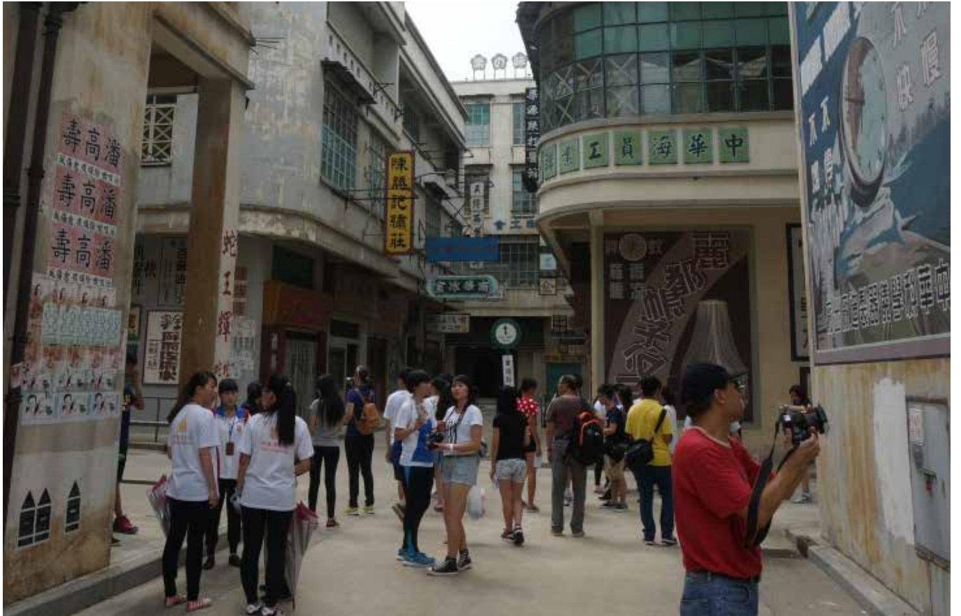
Youth Ambassadors at the National Arts Studio.