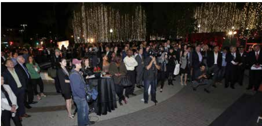
Audience at the opening ceremony of the 4th China International Co Production Film Screenings.