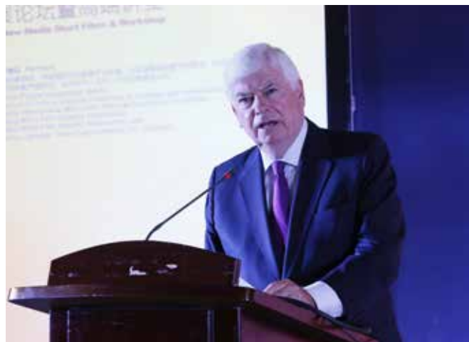
MPAA Chairman and CEO Senator Chris Dodd addresses the audience at the MPA-CICE New Media Short Films Forum.