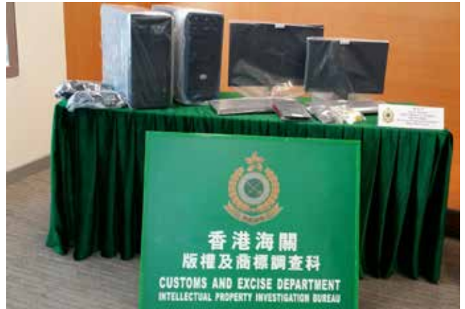
Items seized were displayed during the press conference.

The suspect in this case uploaded a large quantity of infringing material including comics, Hong Kong and international movies, and Hong Kong and Japanese TV dramas. Infringed content belonging to Motion Picture Association of America member companies included X-Men: Days of Future Past , The Amazing Spider-Man 2 and Maleficent .