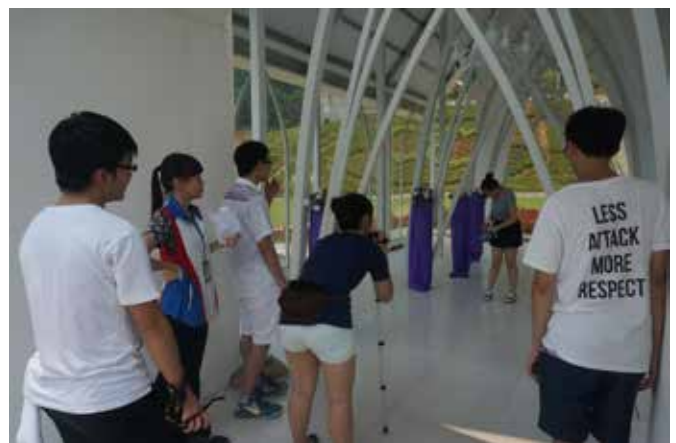
Youth Ambassadors get creative at the National Arts Studio, Xiqiao.

The Youth Ambassadors Against Internet Piracy scheme was founded in 2006 by the HKC&ED and encourages members of 12 Hong Kong uniformed youth organizations to help protect the creative industries and the screen community by preventing illegal file-sharing activities.