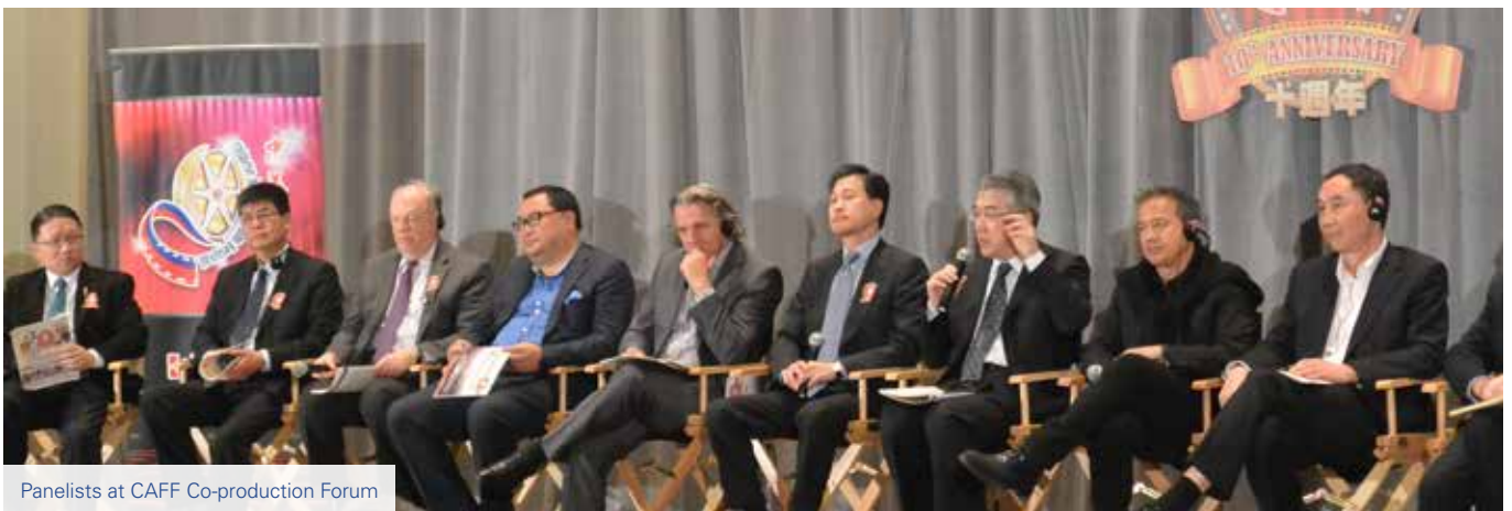
Panelists at CAFF Co-production Forum