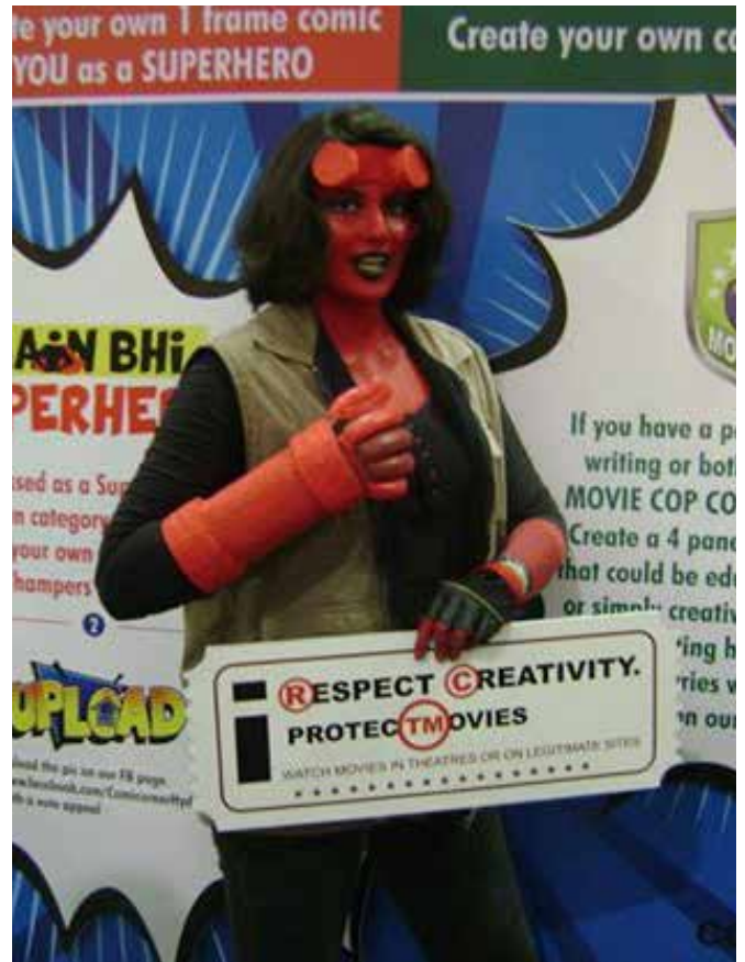
Left: Comic Con participant dressed as Megamind at Comiccorner. Right: Comic Con participant dressed as Hellboy at Comiccorner. Bottom: Volunteers with a Comic Con participant dressed as The Joker at Comiccorner.