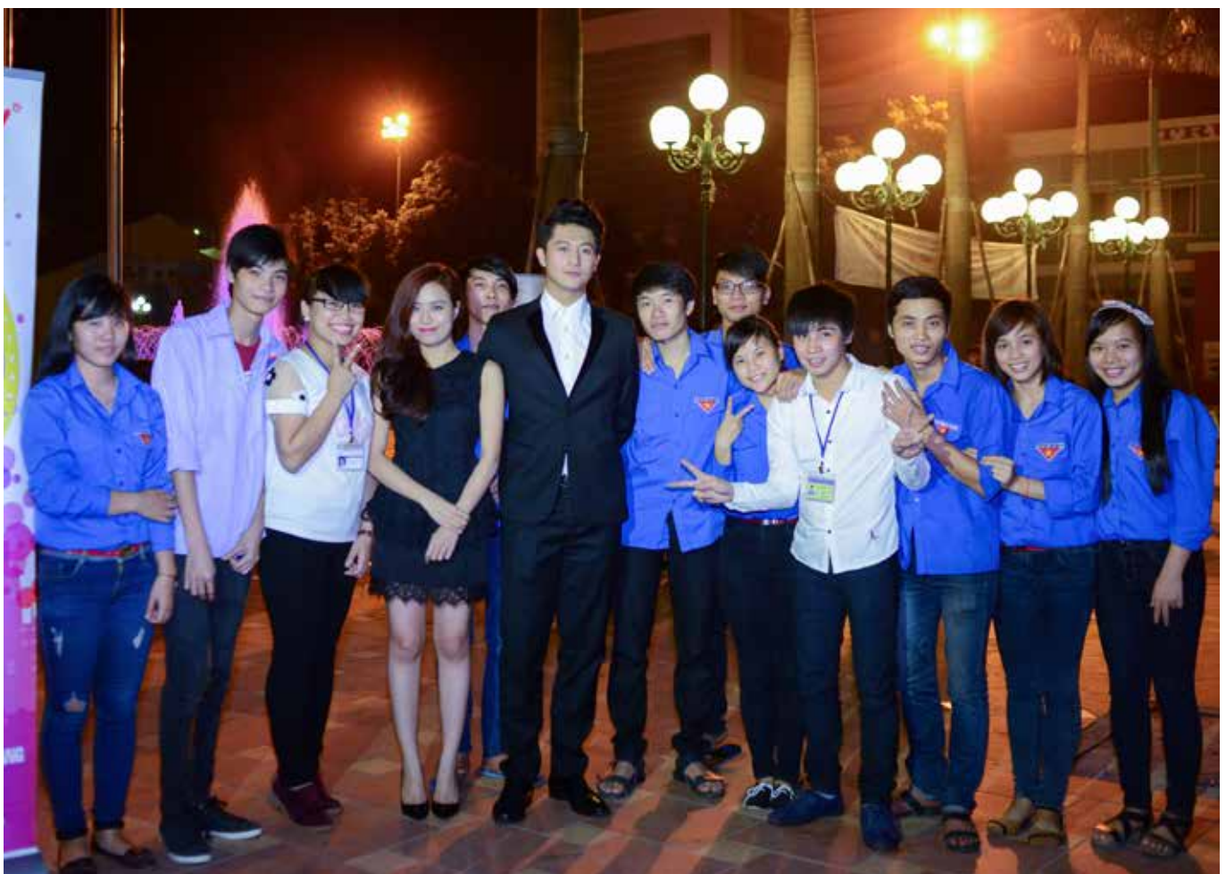
Vietnamese actors Hoàng Thùy Linh and Harry Lu (center, both wearing black) pose with students.