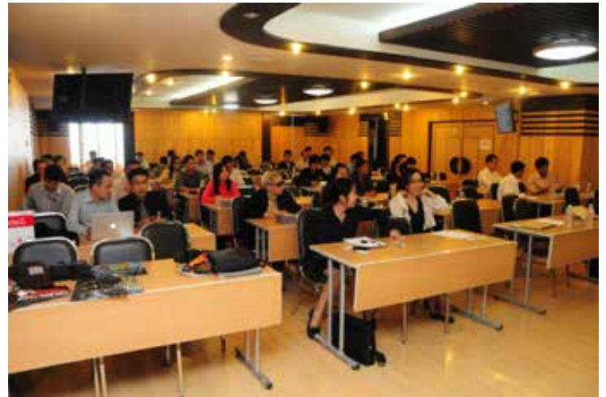
Above and right: Enforcement officials participated in the Internet training session.