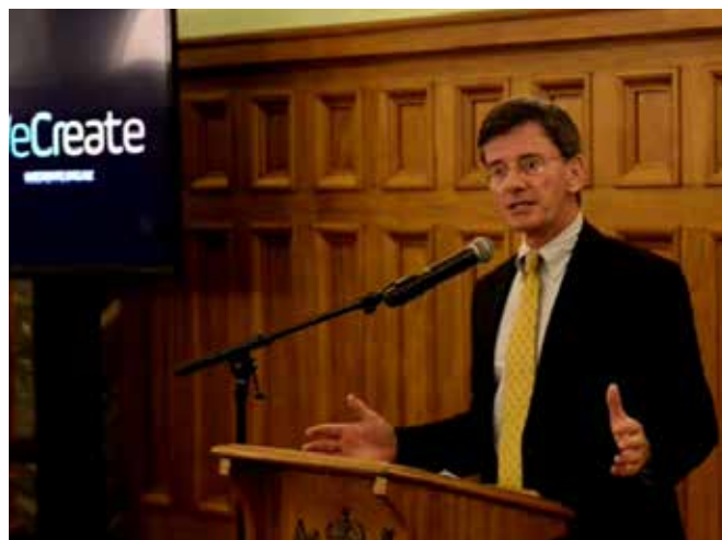
Hon. Christopher Finlayson, New Zealand Attorney-General, hosts the launch of WeCreate at Parliament in Wellington.