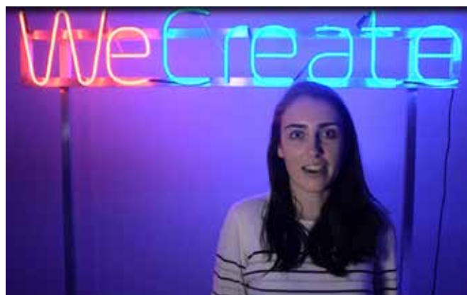
Screen capture from the WeCreate promotional trailer.