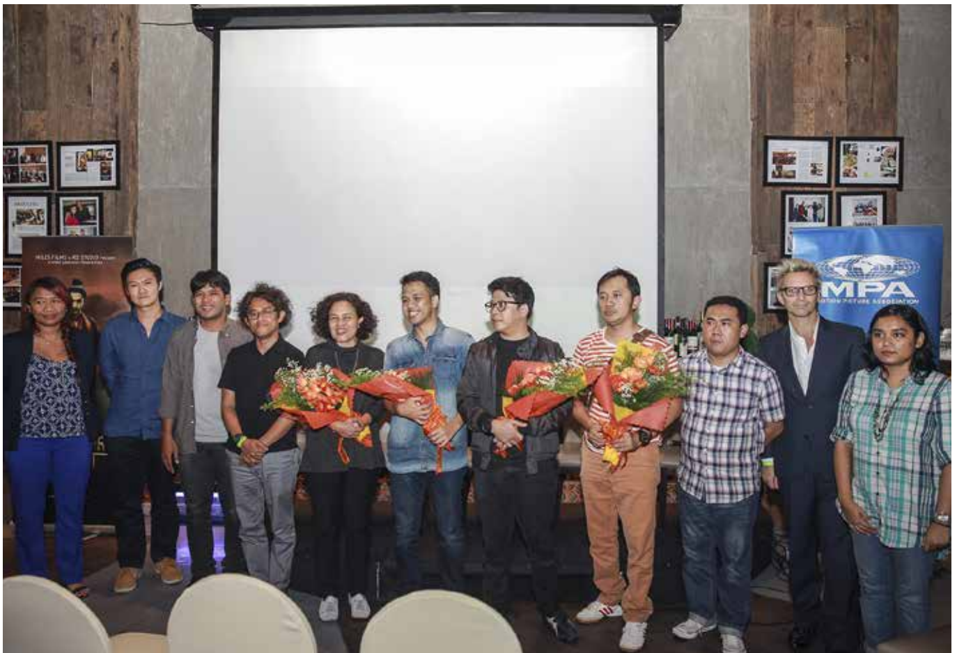
Local screen community representatives at the Indonesia Filmmakers Gathering during JIFFEST.

Around 100 filmmakers, scriptwriters, journalists and film lovers were in attendance. The Jakarta International Film Festival (JiFFest) 2014 ran from November 14 to December 6, 2014.