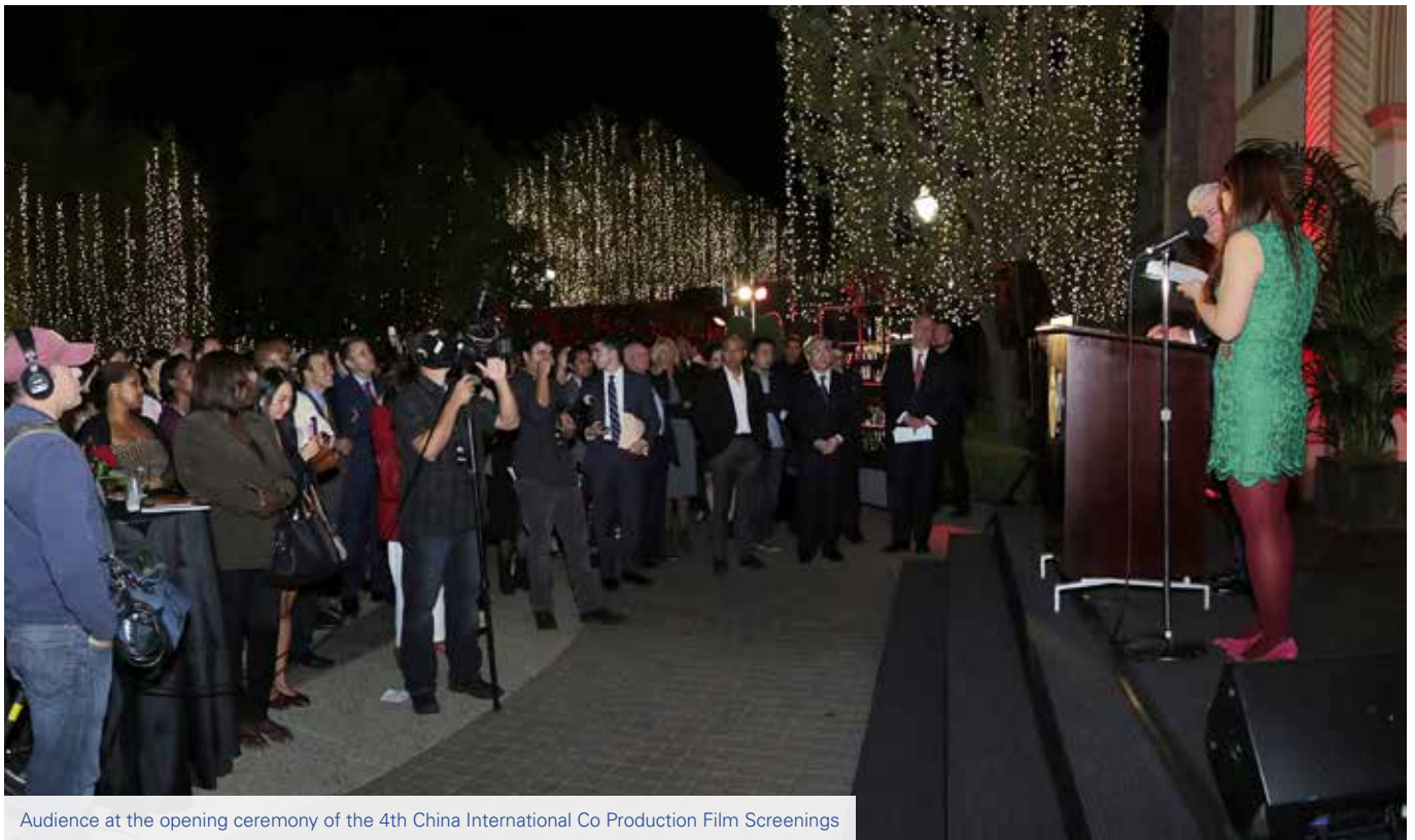
Audience at the opening ceremony of the 4th China International Co Production Film Screenings