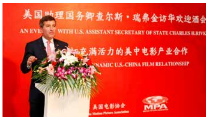
Assistant Secretary of State for the Economic and Business Bureau Charles H. Rivkin addresses the audience at the event.