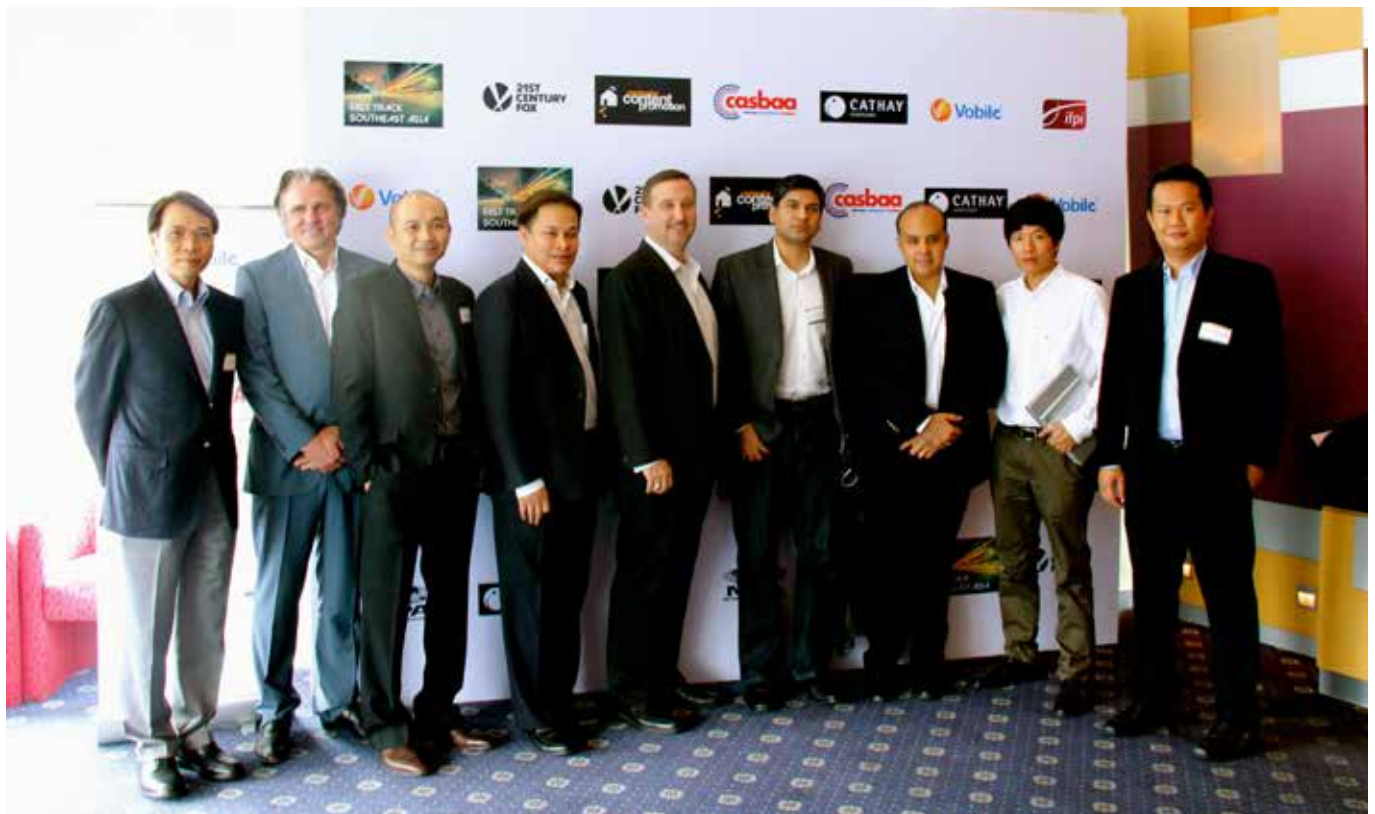
Event panelists gather for a photograph during the networking session.

The forums and networking event were held at Cathay Cineleisure Orchard in Singapore. The event was organized by the Centre for Content Protection, and was supported by 21st Century Fox, CASBAA, Cathay Cineplex, IFPI, MPA and Vobile.