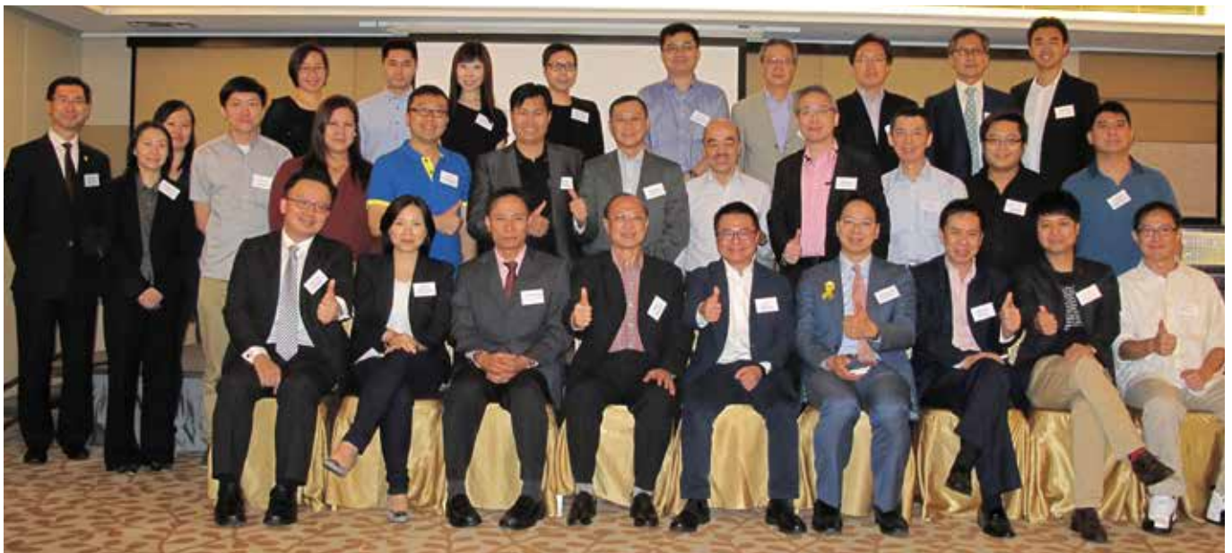
Delegates support the Code for Release of Information.

Participants in the symposium included representatives from the Hong Kong Police Force, Hong Kong Customs and Excise Department, The Office of the Privacy Commissioner for Personal Data, telecoms operators, data center operators, domain name operators, academic institutions, online discussion forums, hosting service providers, music and movie producers and other copyright owners. The draft Code can be viewed online at http://www.hkispa.org.hk/symposium2014.html .