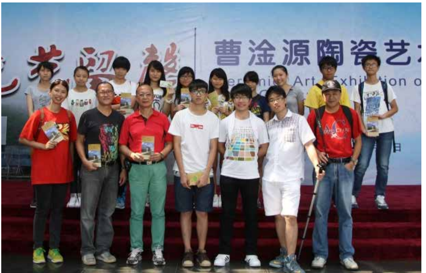
Youth Ambassadors pose for a photo in Xiqiao.