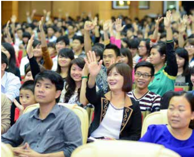
Enthusiastic students jump at the chance to win souvenirs during Q&A.

Vietnamese actors Hoàng Thùy Linh and Harry Lu, as well as the MPA, on why copyright matters for the development of the screen industry.